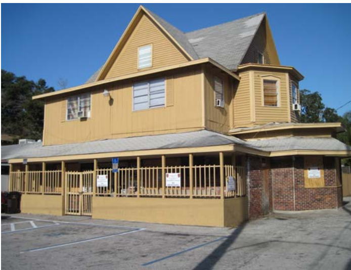
M & M Market, corner of Bridge Street and Dr. Martin Luther King, Jr. Avenue

The St. Augustine Police Department stays in touch with the community through being active with the Lincolnville Crime Watch which is the oldest and most active crime watch in the city. They keep the Police Department abreast of neighborhood concerns and issues so the Police Department can address them in a timely manner. This partnership has proven to be an invaluable tool for Lincolnville and the law enforcement community.