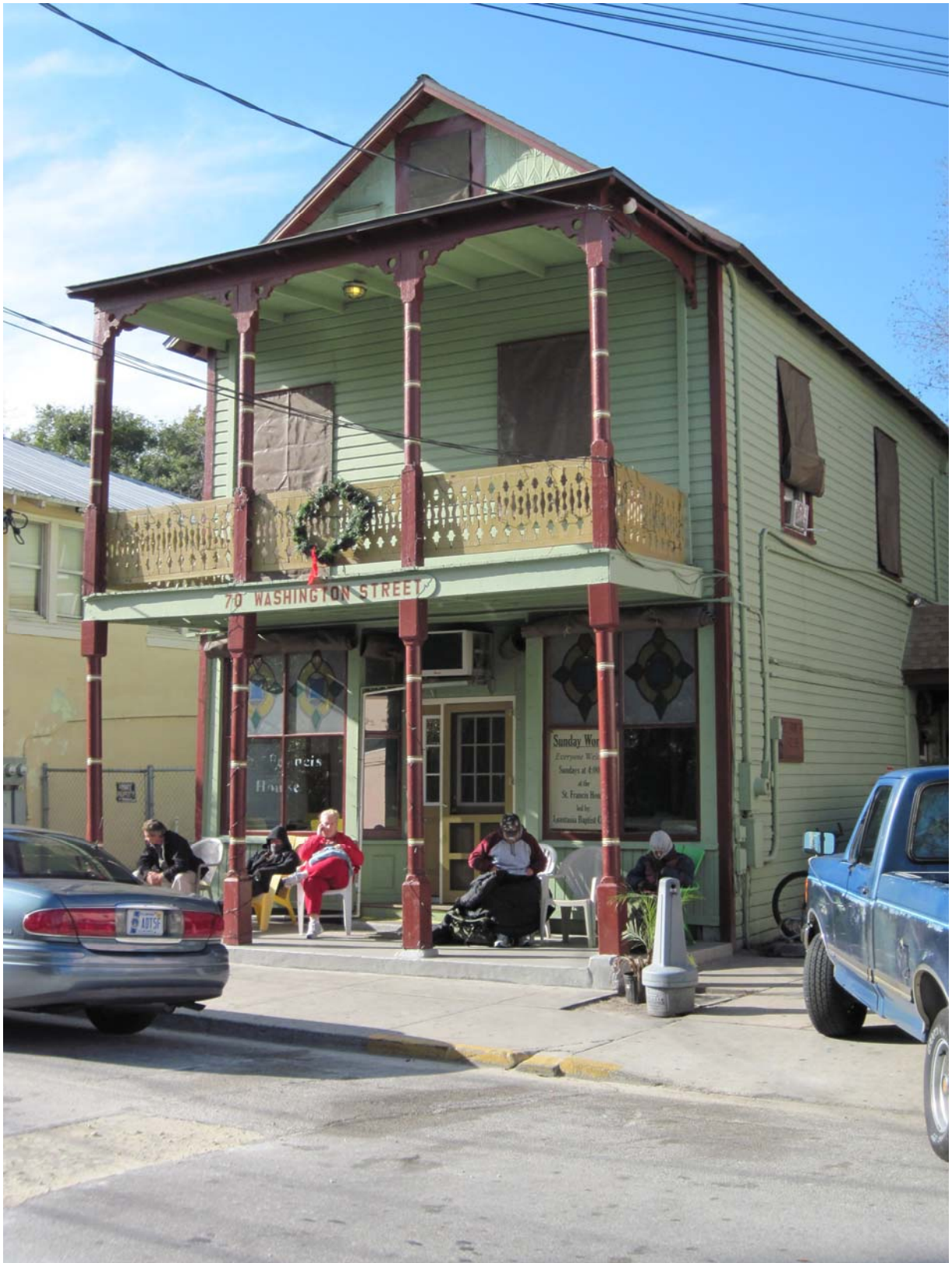
St. Francis House Homeless Shelter