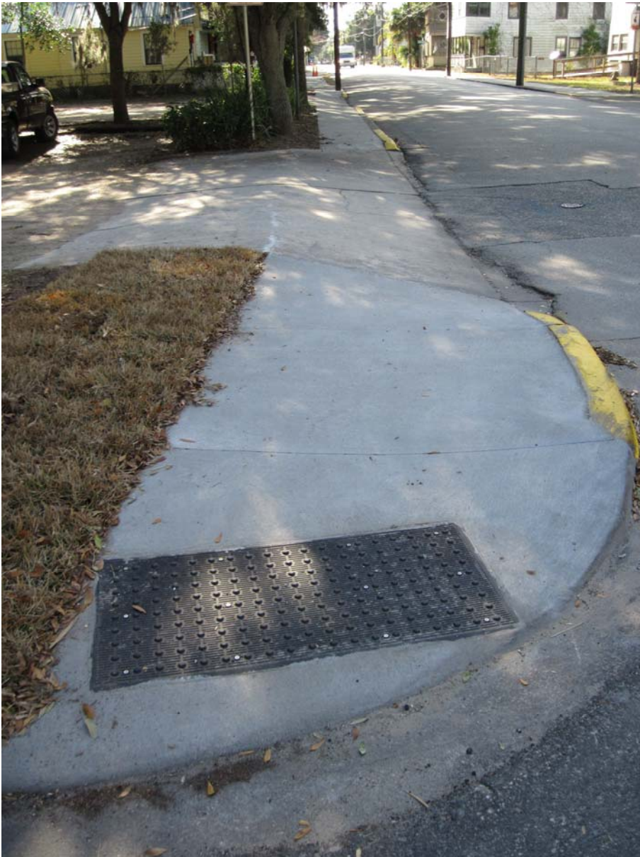
New sidewalk across from the Excelsior High School

linear feet of sidewalks will be installed at a total cost of close to $22,000. These sidewalk improvements are well under way and scheduled to be completed in Spring 2011. In addition to these sidewalk improvements, the city has recently updated and re-painted the yellow curbs within the entire district, where street parking is not allowed. These no parking areas improve traffic flow and intersection visibility for cars traveling through the neighborhood.