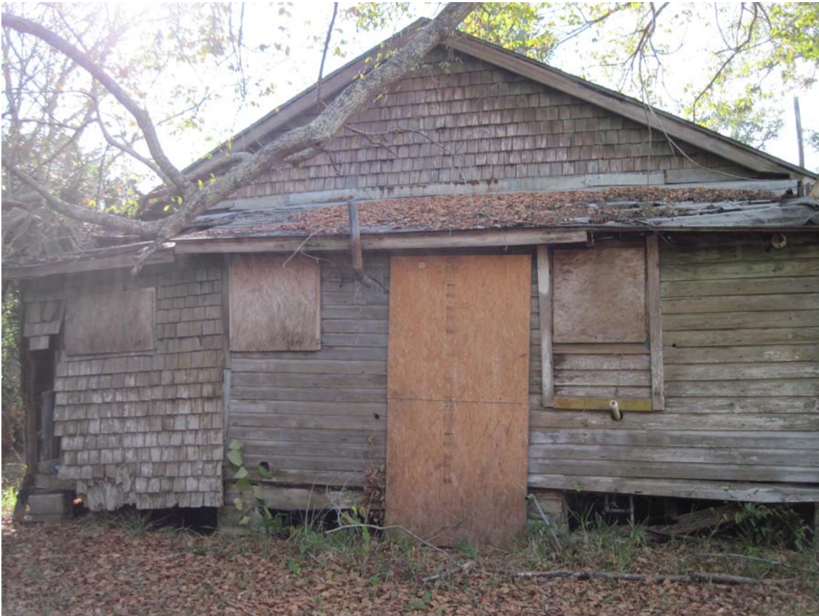
185 Dr. Martin Luther King, Jr. Avenue

The City Code Enforcement office has identified 21 properties in the neighborhood that contain junk, debris, untagged automobiles or have weeds and grass unattended. These properties owners have been contacted and efforts are underway to correct these code violations. In addition to this, two properties, 185 and 187 Dr. Martin Luther King, Jr. Ave. have been identified as dangerous structures and are scheduled for abatement. These homes are vacant and have not been maintained, are open to trespass and have been condemned by the city Building Official. The removal of these two structures will make an immediate improvement to this block at the southern end of the neighborhood.