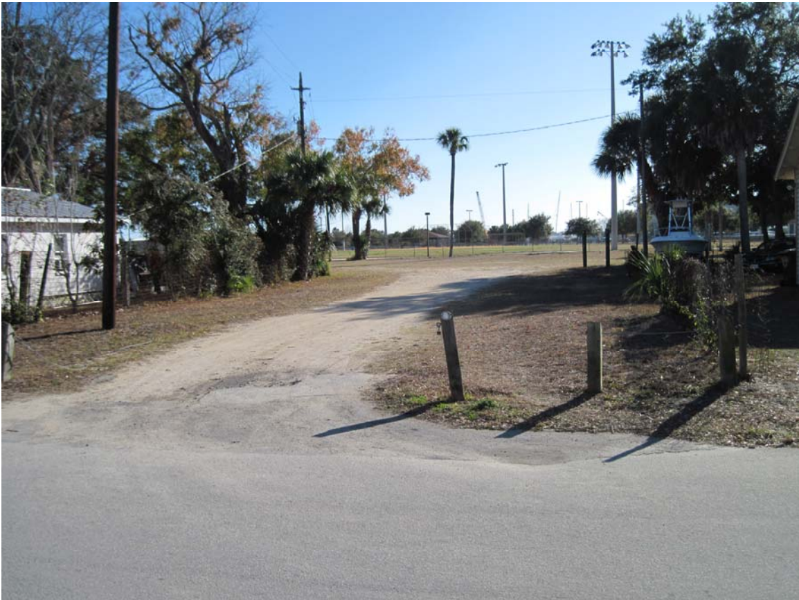
Entrance to Community Garden at Eddie Vickers Field

The City is planting 16 Drake Elm trees, 9 Crape Myrtle trees and three Cathedral Oak tree in the neighborhood, all of which will be planted on public property and public right of way, in an effort to improve street trees in the neighborhood. This project is being done by the city Public Works Department in conjunction with the sidewalks improvements along Dr. Martin Luther King, Jr. Avenue. This landscaping project represents a $2,000 investment in the future tree canopy of the neighborhood.