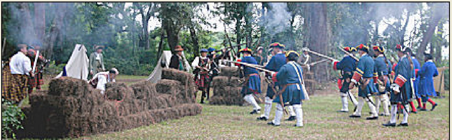
Spanish forces attack British-held Fort Mose in Saturday reenactment.