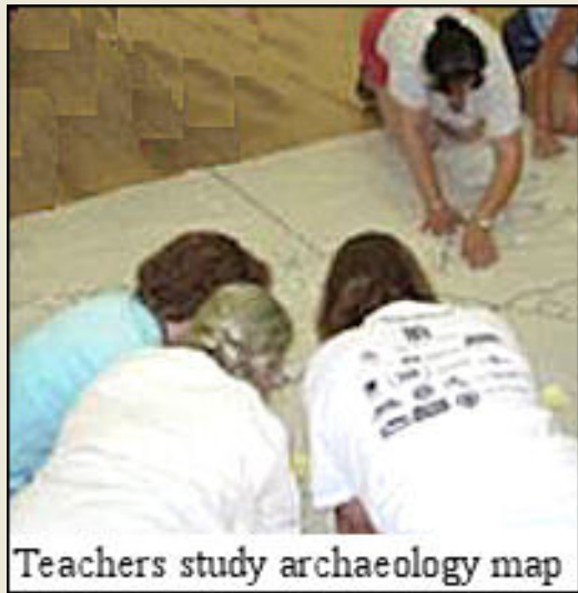
Teachers study archaeology map

There's more to archaeology than digging holes, as 3 rd -5 th grade teachers will find out next week in a two-day Project Archaeology Teacher Workshop designed to work archaeology into classroom activities.