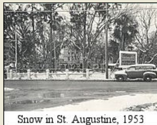
Snow in St. Augustine, 1953

Henry Flagler, both a philanthropist and hard-headed businessman, encouraged and financed settlement of farmers and grove-tenders along the way as he spread his interests through railroads down Florida's east coast. When a killing freeze hit in the mid 1890s, he bolstered those settlers not with handouts but with loans to reestablish themselves - and keep his Florida dream alive.