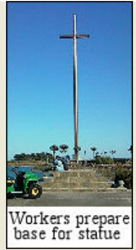
Workers prepare base for statue