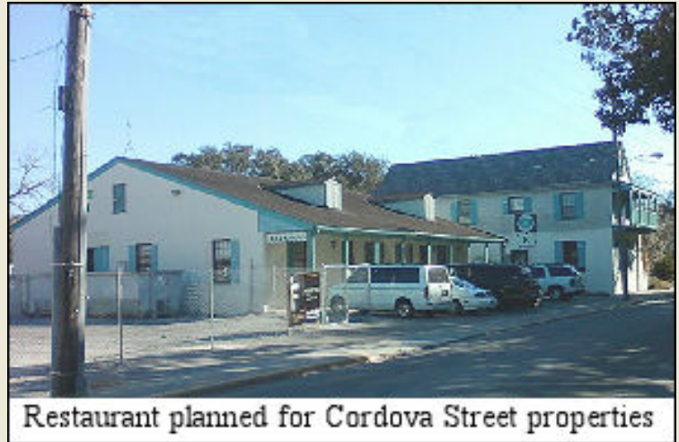
Restaurant planned for Cordova Street properties