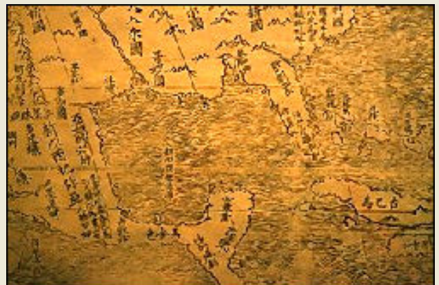
Detail of Matteo Ricci's 1602 map showing Florida and the Gulf of Mexico

The map description of North America is brief, with mentions of "humped oxen" or bison, wild horses and a region named "Ka-na-ta." (Canada?) "In olden days, nobody had ever known that there were such places as North and South America or Magellanica," he wrote. "But a hundred years ago, Europeans came sailing in their ships to parts of the sea coast, and so discovered them."