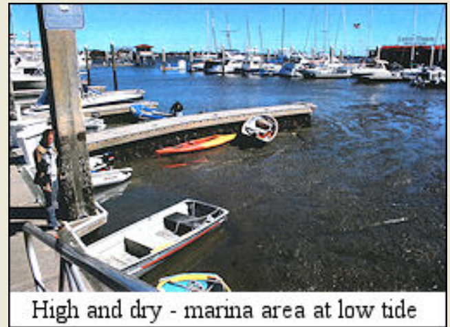
High and dry - marina area at low tide

Piggott said the balance of funding could be drawn from the marina's reserve account.