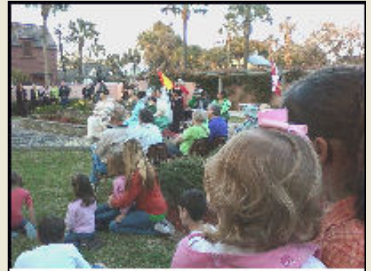
Knighting drew a crowd