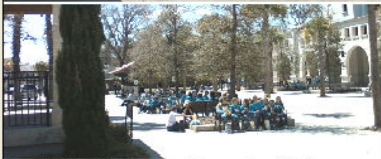
Visitor Center bus lot, pavilion filled up

Cars lined up to cross our reopened bridge, buses and RVs filling the bus lot, cars queued up entering our parking facility, school groups filling our Visitor Center promenade to eat their lunch on a day's visit - just a sampling of what's to come as we make plans to tell the world where we are.