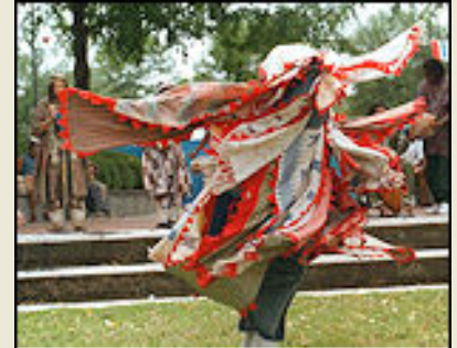
Gullah Festival dancer