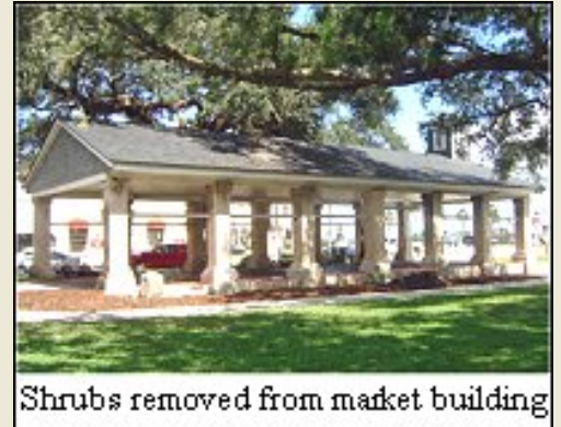
Shrubs removed from market building

Shrubbery around the market building has been removed to increase visibility. Under the ordinance, this will be the only site in the Plaza for vending and visual arts activity.