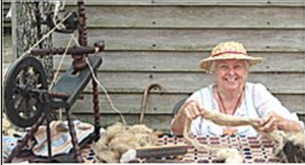
Spinner at work during annual Colonial Arts Fair

The Colonial Spanish Quarter will host the 21st annual Colonial Arts and Crafts Fair Saturday and Sunday - our annual step back in time with more than 30 craftspeople demonstrating indigo dyeing, broom making, woodcarving, and numerous other colonial skills. Details here .