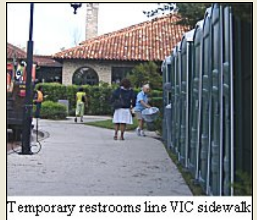
Temporary restrooms line VIC sidewalk

The VIC was built in 1935 under the Federal Emergency Relief Administration, predecessor to the Works Progress Administration (WPA), and renovated with the completion of our Historic Downtown Parking Facility in 2006.