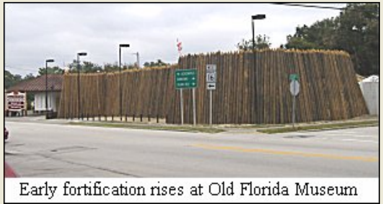
Early fortification rises at Old Florida Museum