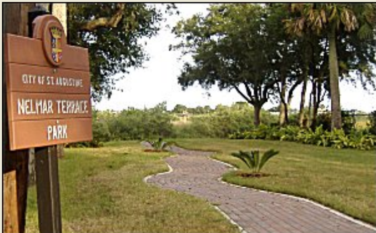
Nelmar Terrace Park - a team effort

Bisected by a brick walkway, flanked by native foliage, Nelmar Terrace Park at the end of Nelmar Avenue is the latest public/private success story.