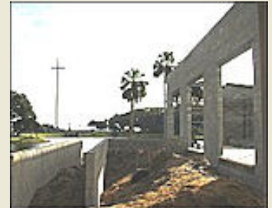
Great cross backdrops project

Work continues on an exhibit center on the Mission of Nombre de Dios grounds, scheduled for completion early next year. The 4,000-square-foot center, made possible through the Crisp-Ellert Foundation, is expected to feature Diocese artifacts, the outer casket of St. Augustine Founder Pedro Menendez, and an exhibit of the history of Spanish missions of Florida.