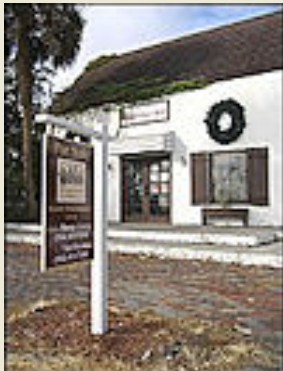
Shops for sale