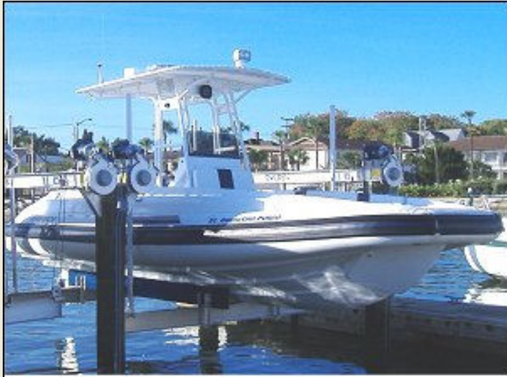
Sleek new city police boat - courtesy of criminals

Our city is outfitting a new, powerful, patrol boat - courtesy of criminals.