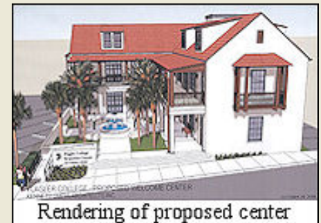
Rendering of proposed center