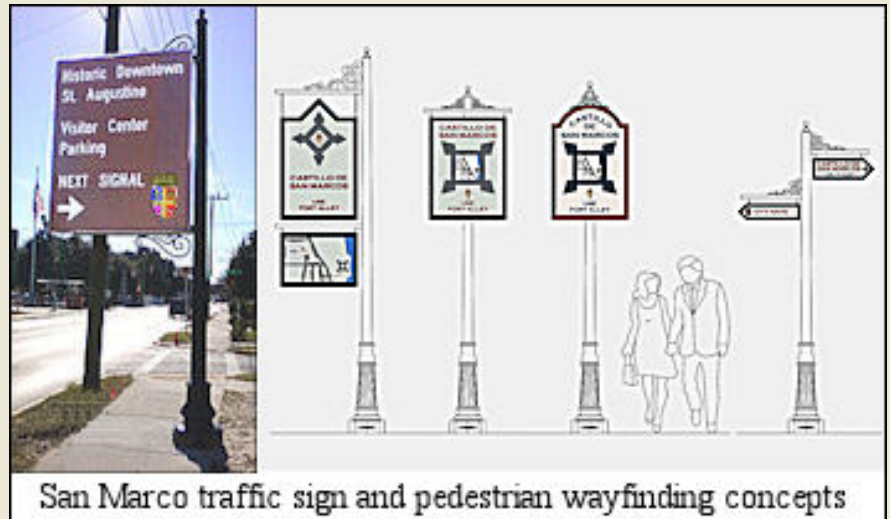
San Marco traffic sign and pedestrian wayfinding concepts